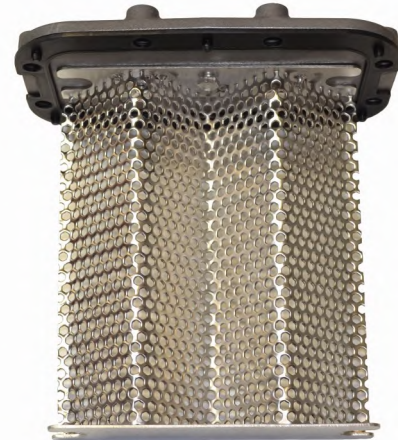
Large Built-in Z-Plate Strainer