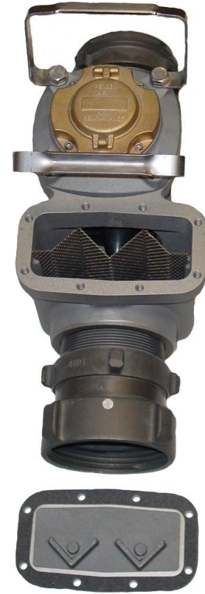
Large Built-in Strainer